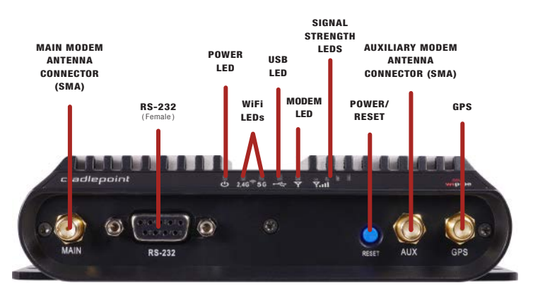
See Product Manual for suggested antenna positions.