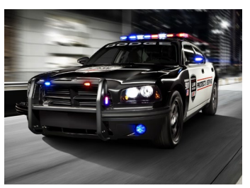
EMS / First Responders / Fleets