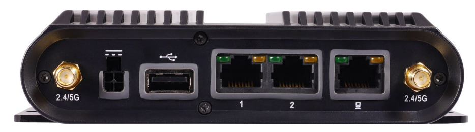
Non-WiFi versions available.

For more information, visit Cradlepoint.com/CradleCare