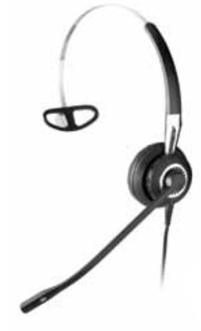
Jabra BIZ™ 2400 IP Mono

GN Netcom is a world leader in innovative headset solutions. GN Netcom develops, manufactures and markets its products under the Jabra brand name.